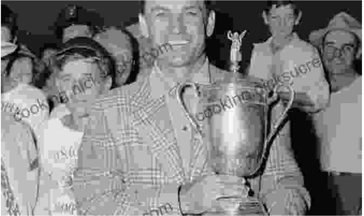
Image Alt Attributes